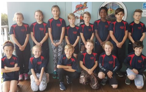
Our OP speedsters before their races last Friday.